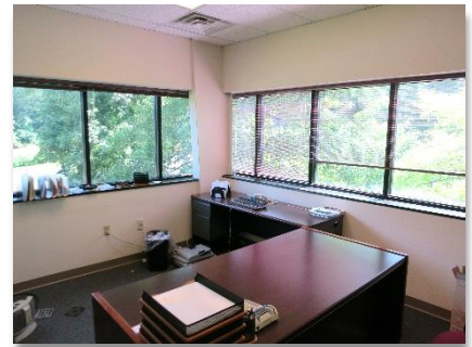
View of Typical Private Office