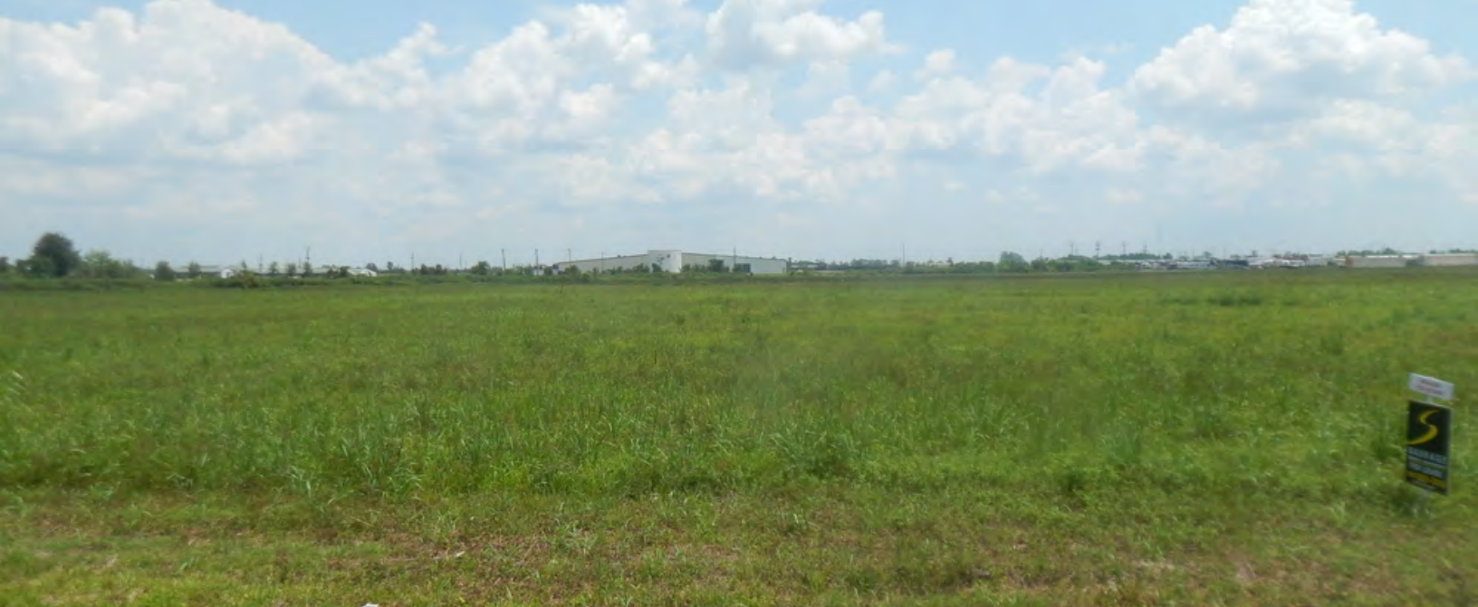
4 - 33 Acres Available