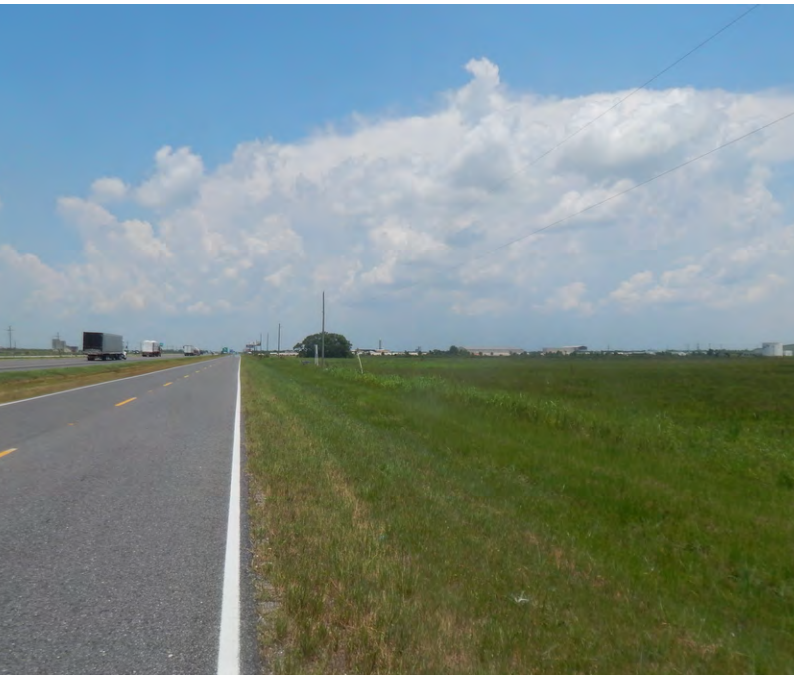
View from I-10