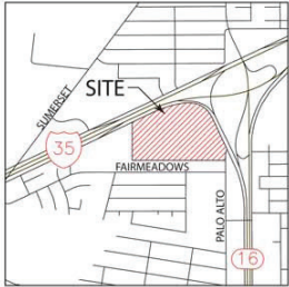
LOCATION MAP MAPSCO MAP GRID: 681C1 NOT TO SCALE