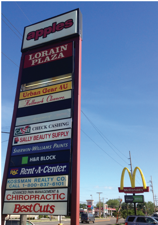
4,216 SF free-standing building with T-Mobile