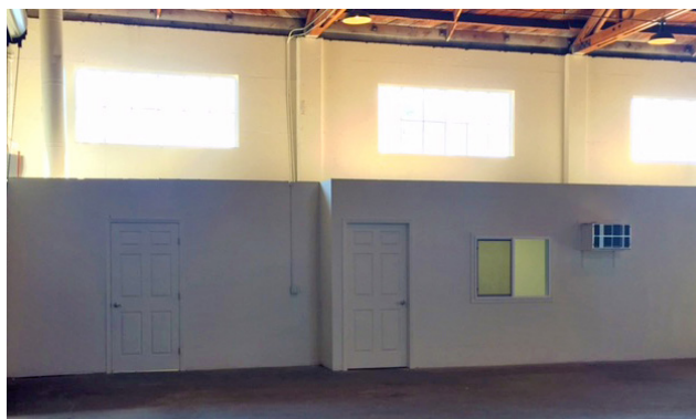
PRIVATE OFFICES IN WAREHOUSE