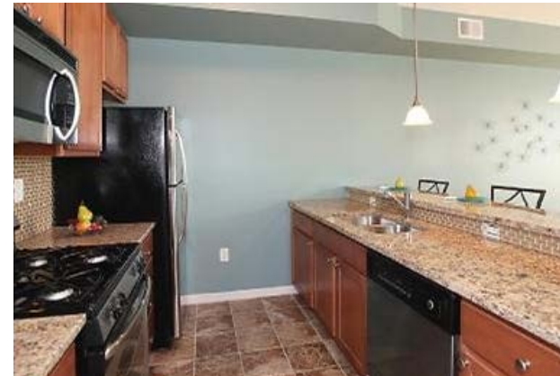
Kitchens feature stainless steel appliances and granite countertops (photo, finishes, and floor plan are of the adjacent 8 unit condo building).

For Further Information Please Contact Exclusive Broker: