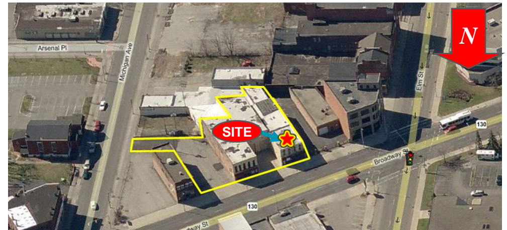
Tax Map / Aerial