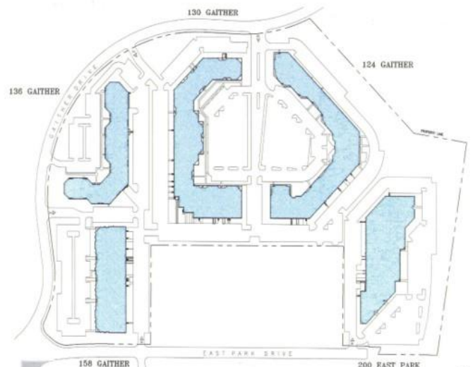
GATEWAY AT EASTGATE