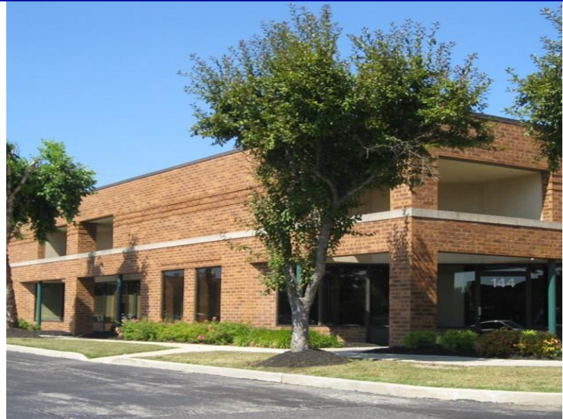
EAST GATE DRIVE