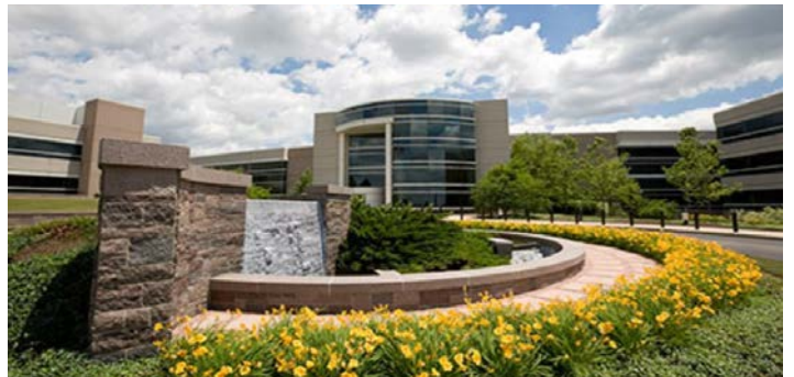
P&G Mason Business Center