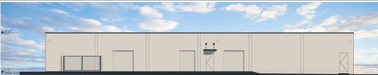
03 WEST ELEVATION SCALE: 3/16" = 1'-0"