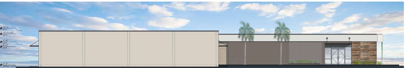
02 SOUTH ELEVATION SCALE: 3/16" = 1'-0"