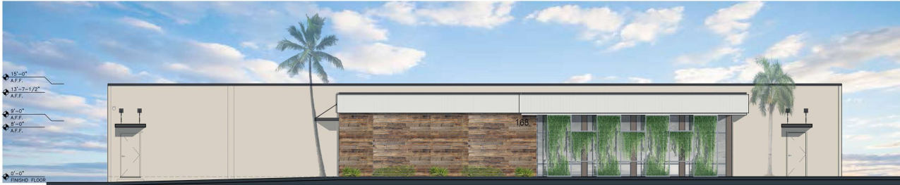
01 EAST ELEVATION SCALE: 3/16" = 1'-0"