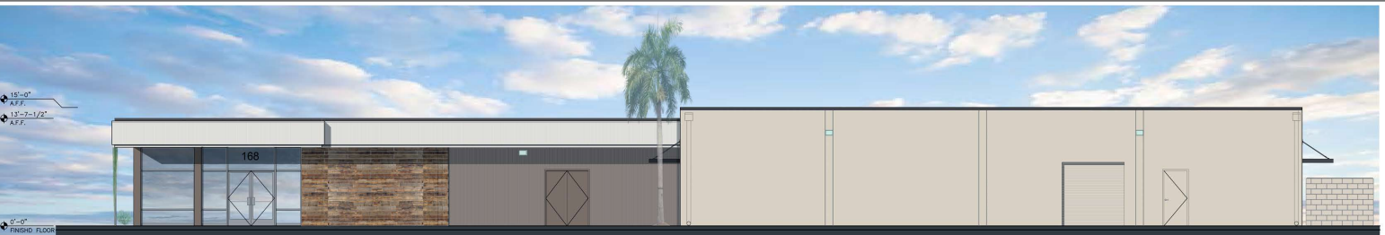
04 NORTH ELEVATION SCALE: 3/16" = 1'-0"