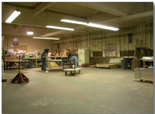
Showroom - Office - Workspace