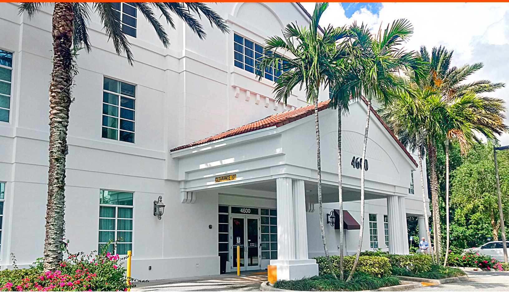
MIDTOWN DELRAY OFFICE BUILDING