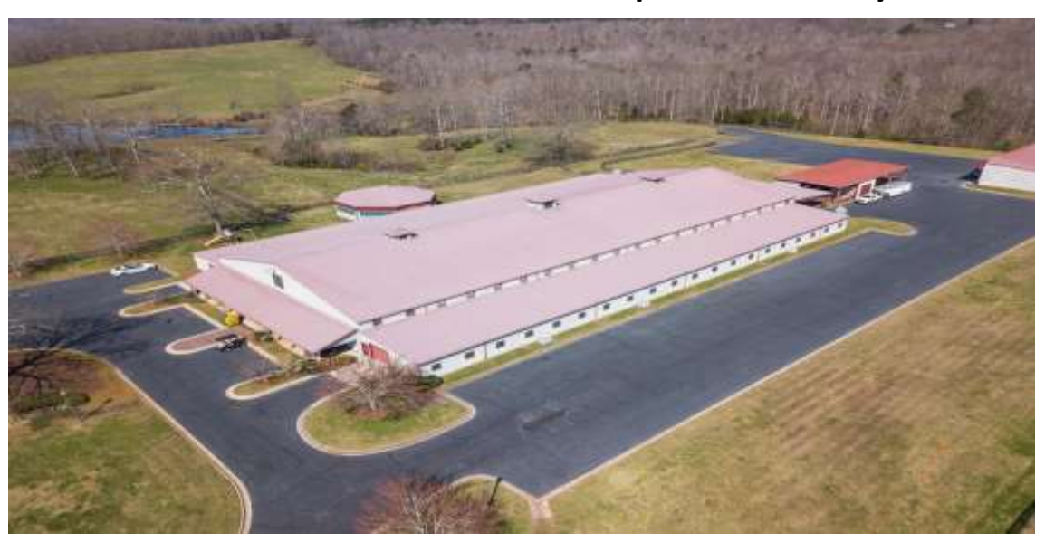
40,000 s.f. entertainment-facility currently holding a special car collection. Can be and was an equestrian facility.