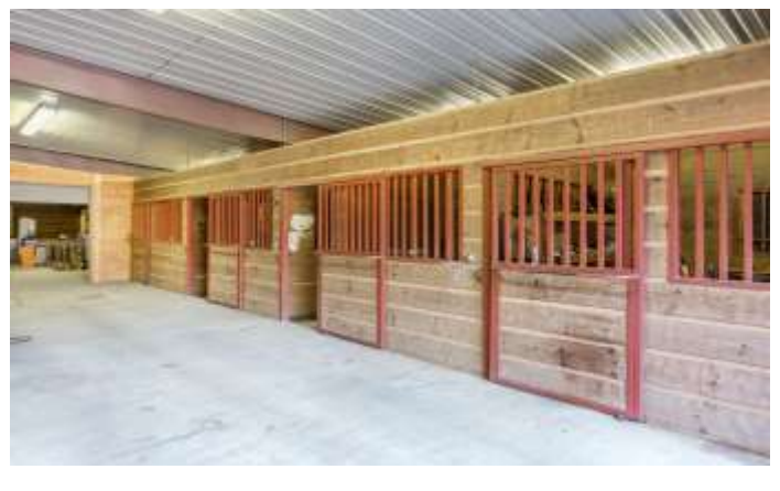
All materials furnished is from sources deemed reliable, but information has not been verified and is subject to errors or omissions