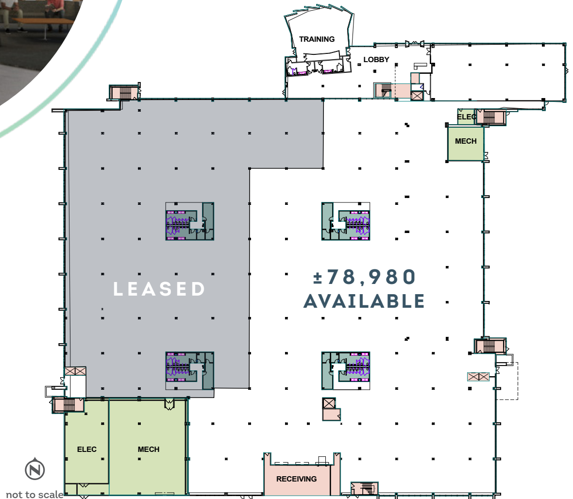
1ST FLOOR ±131,588 SF