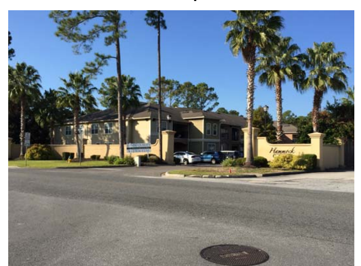
Hammock Cove Apartments, Entry