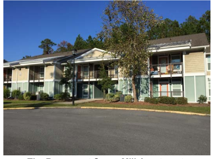
The Reserve at Sugar Mill Apartments