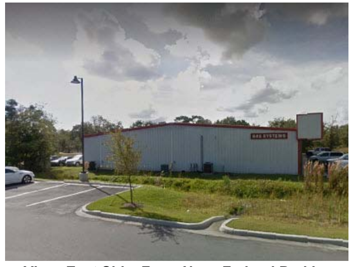
View, East Side, From Navy Federal Parking