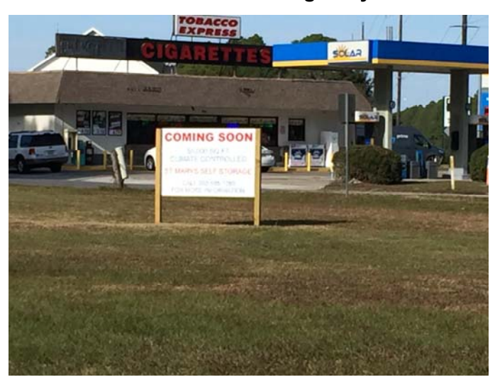
Self Storage, Coming Soon, Just South