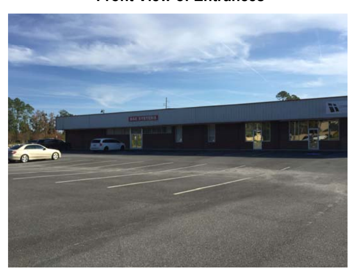
View of Front from Parking Lot