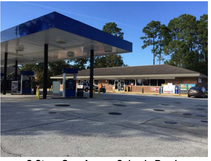
C-Store-Gas, Across Colerain Road