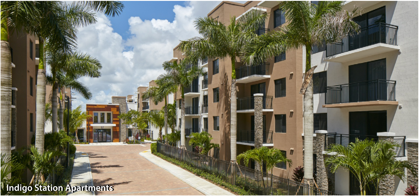
Indigo Station Apartments