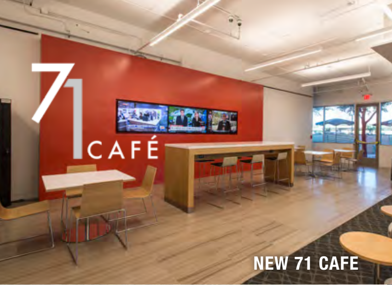
NEW 71 CAFÉ