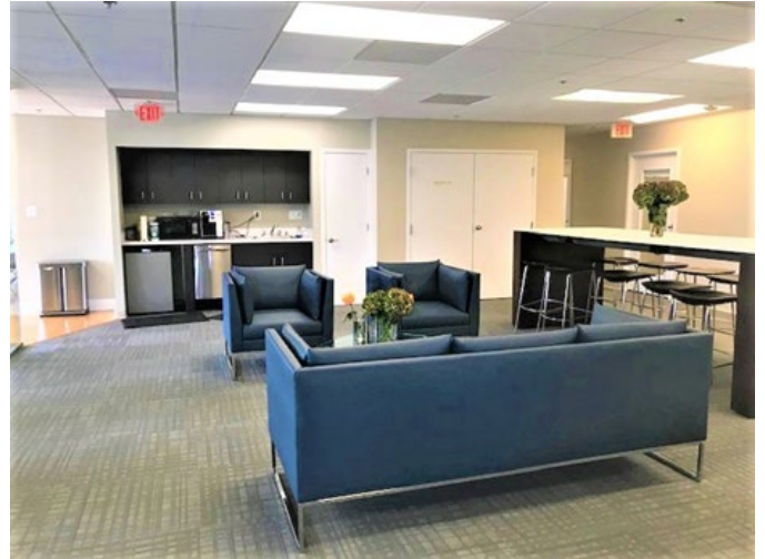
CONFERENCE ROOM AND KITCHEN