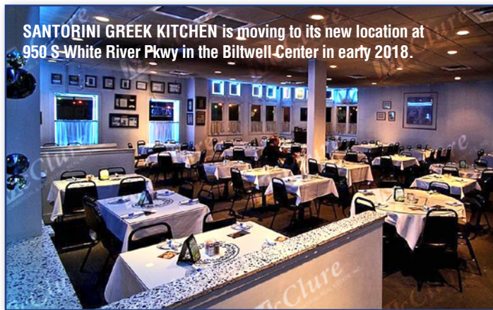
SANTORINI GREEK KITCHEN is moving to its new location at 950 S White River Pkwy in the Biltwell-Center in early 2018.