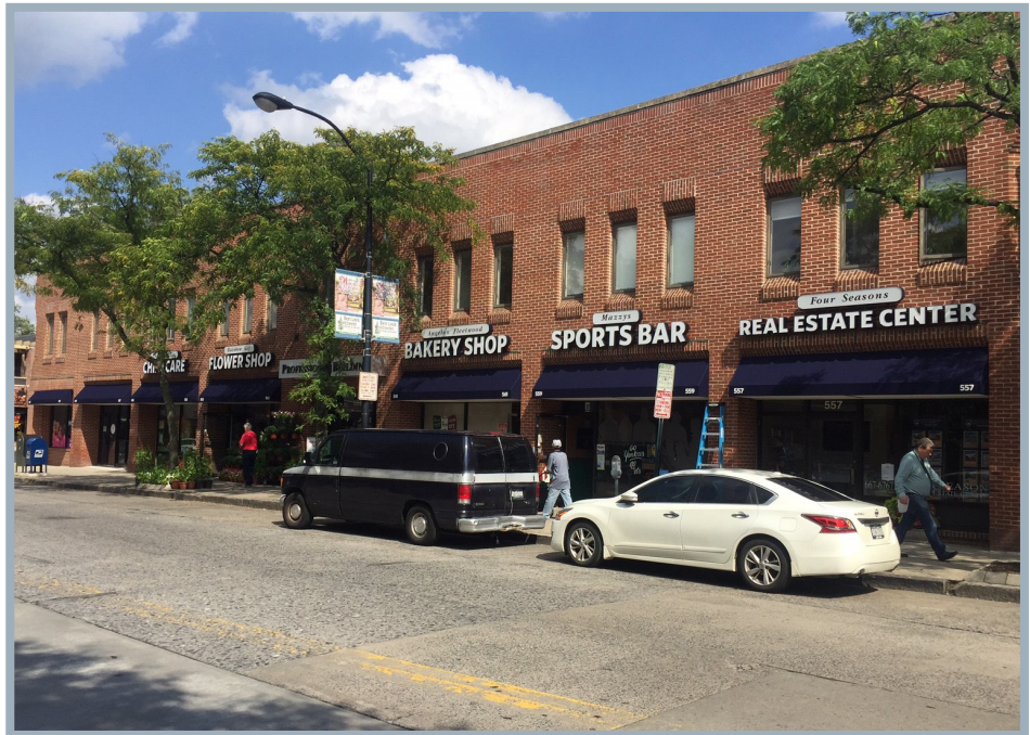
Brand New Facade Upgrades