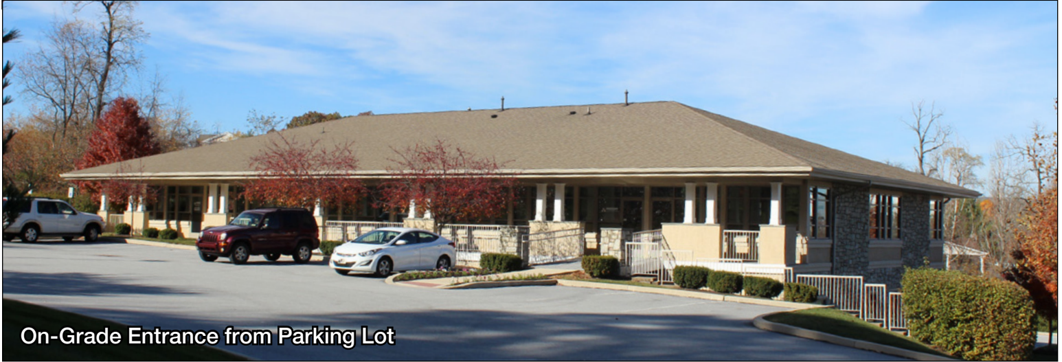
On-Grade Entrance from Parking Lot