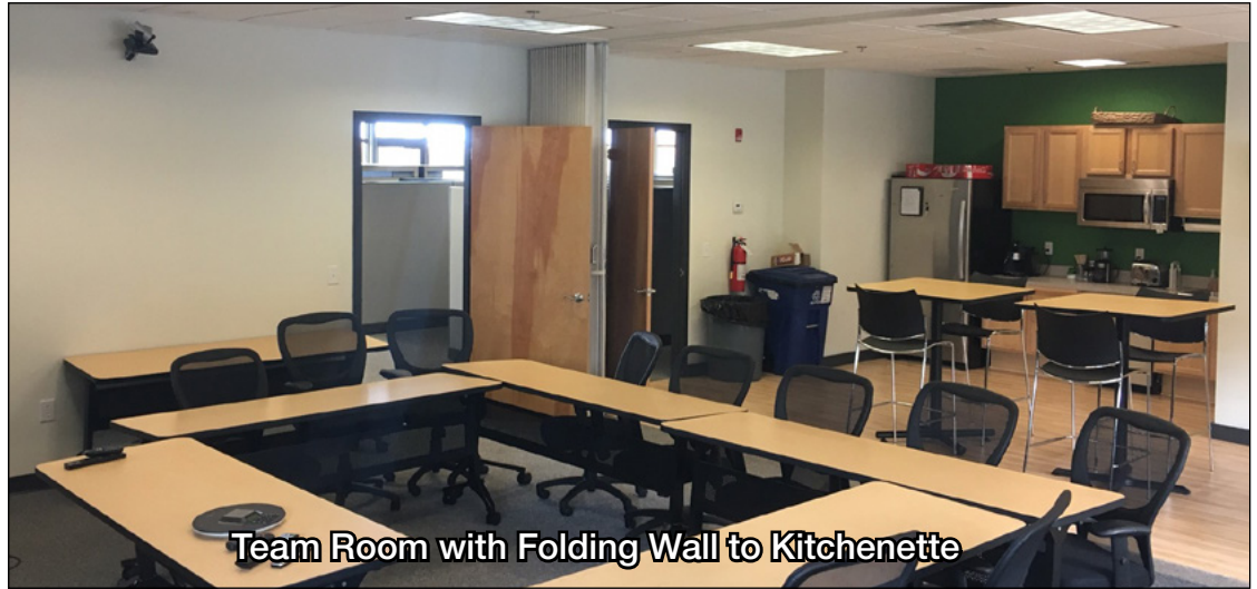
Team Room with Folding Wall to Kitchenette