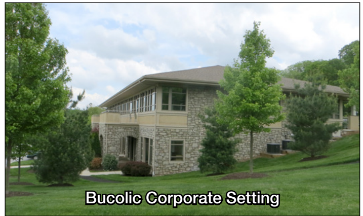
Bucolic Corporate Setting

For more information or a private tour, please contact: