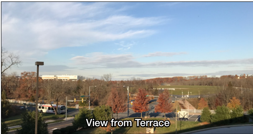
View from Terrace