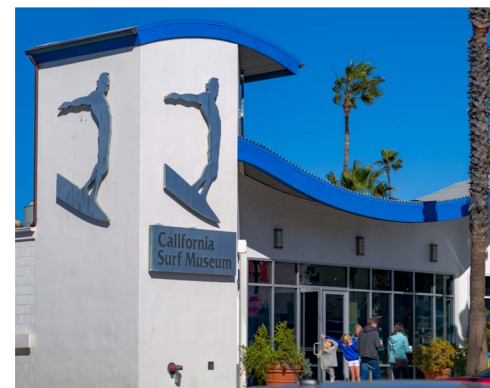
California Surf Museum