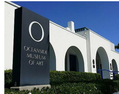
Oceanside Museum of Art