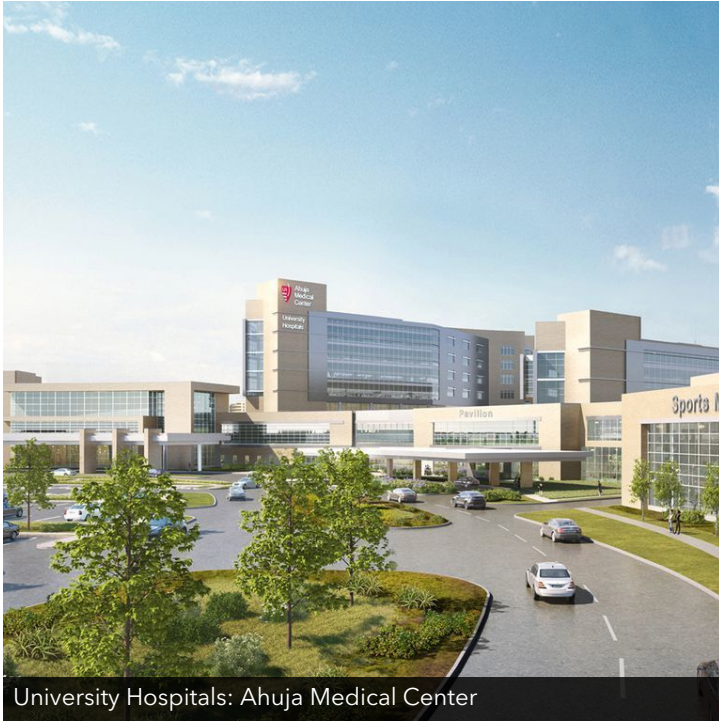
University Hospitals: Ahuja Medical Center

23215 COMMERCE PARK RD, Beachwood, OH 44122