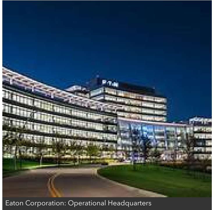
Eaton Corporation: Operational Headquarters