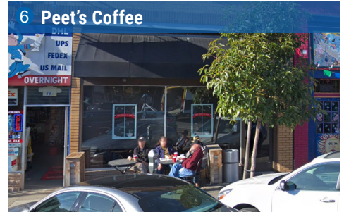
6 Peet's Coffee