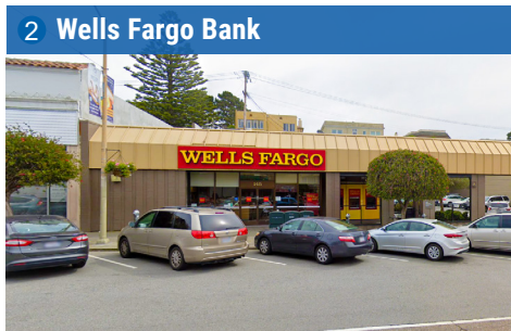
2 Wells Fargo Bank