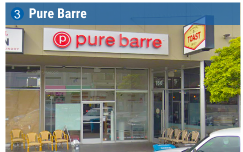
3 Pure Barre