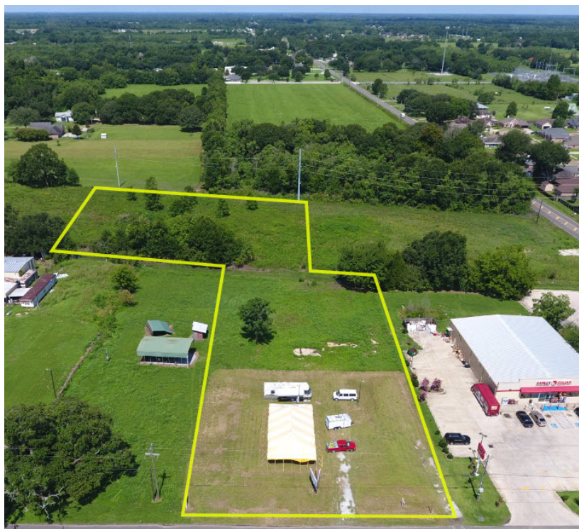
3545 N University