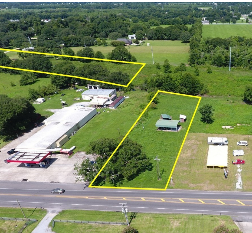
3531 N University