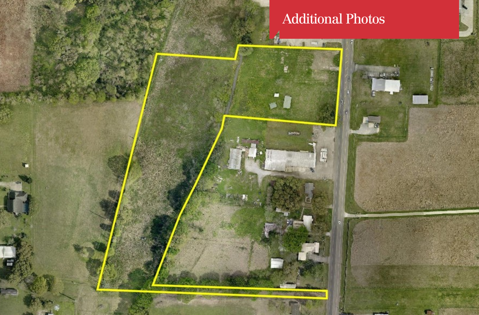
Aerial of both tracts