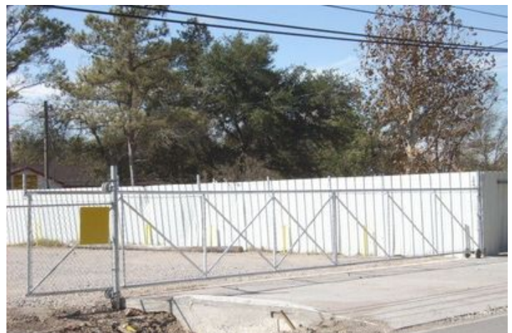
ONE OF 2 AUTO GATES