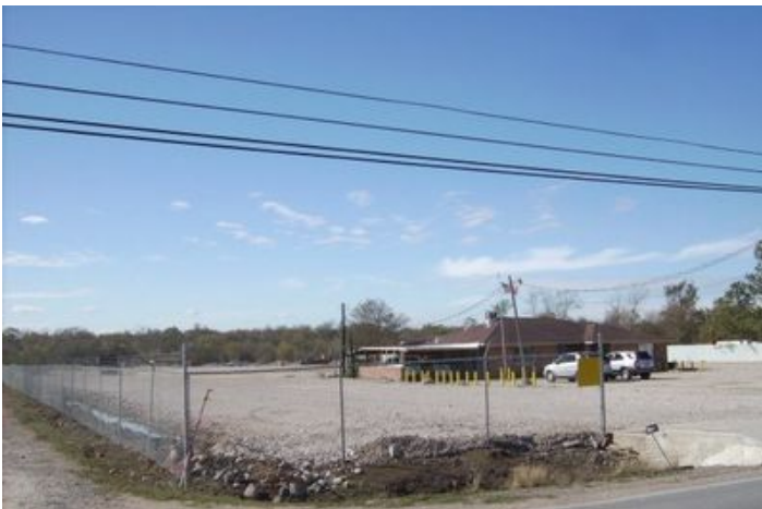
FROM MILLER RD