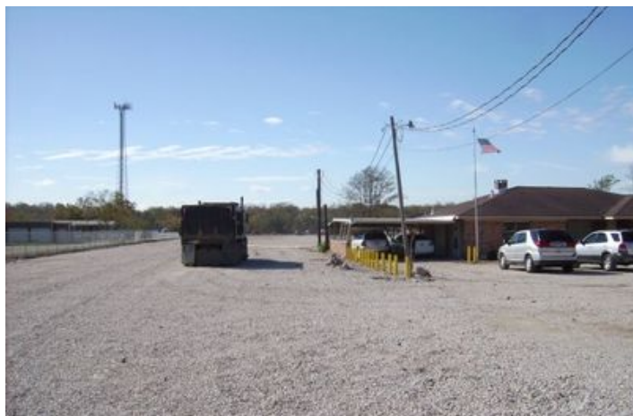
20+ TRUCKS ROCK & NEW GRADING