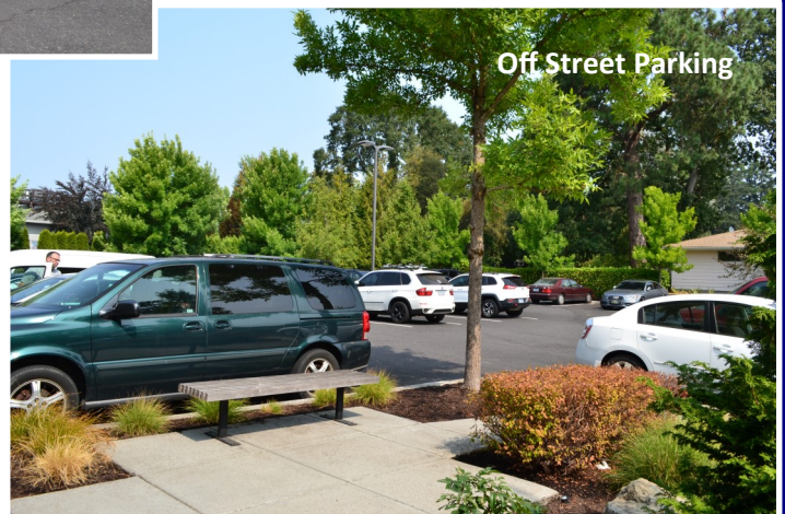
Off Street Parking