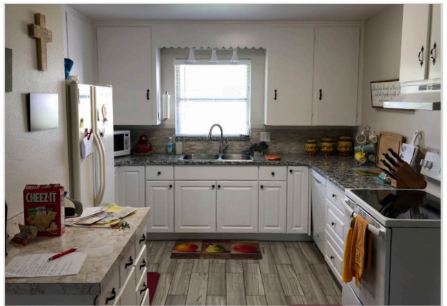
Single Family Home Kitchen