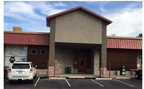
Former Restaurant Space