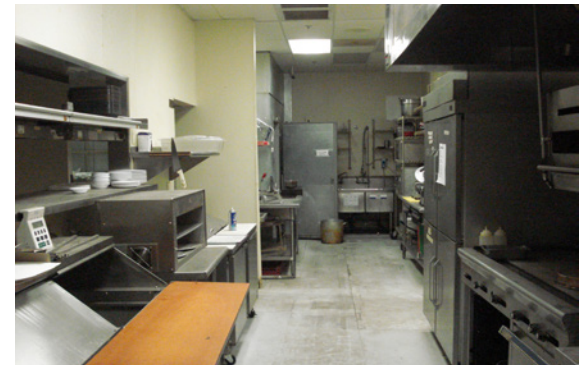
Restaurant Space - Kitchen