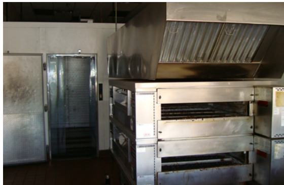
Restaurant Space - Kitchen