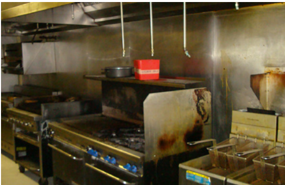
Restaurant Space - Kitchen