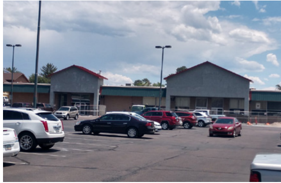
SR 87 Beeline Highway