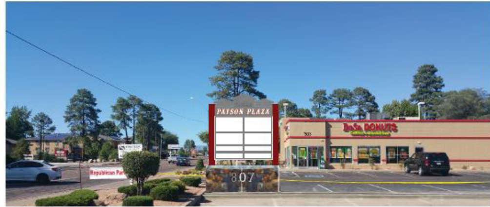
Over all monument approx 15' H x 11' W Total sign space 9' W x 6.75' H