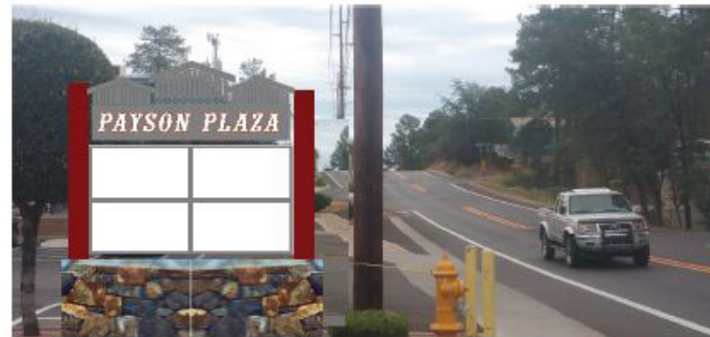
Over all monument approx 11.25' H x 10' W Total sign space 8' W x 4' H