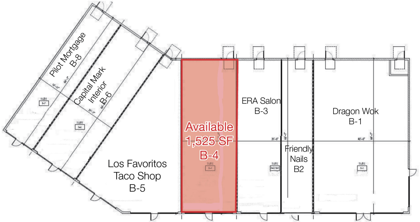
FLOOR PLAN - SHOPS 'B' SCALE: 1/8" = 1'-0"