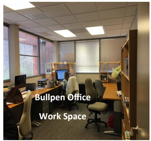
Bullpen Office Work Space