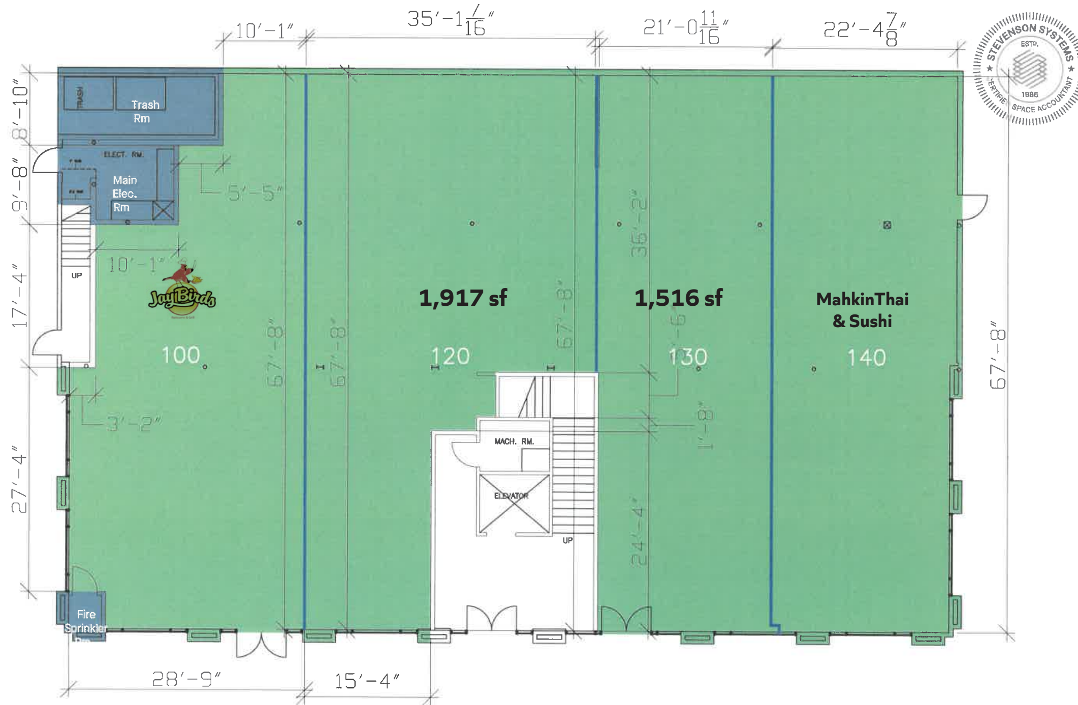
Proposed Demising Plan