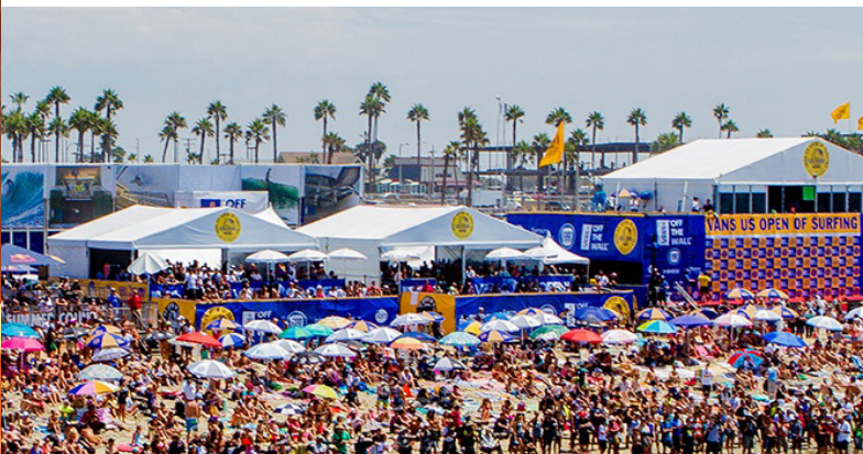
U.S. OPEN OF SURFING