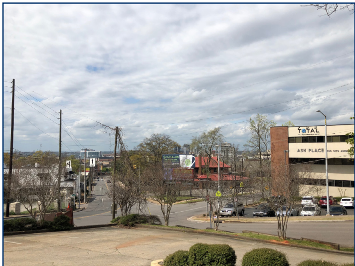
VIEW FROM UNIT

Information deemed reliable, but subject to verification