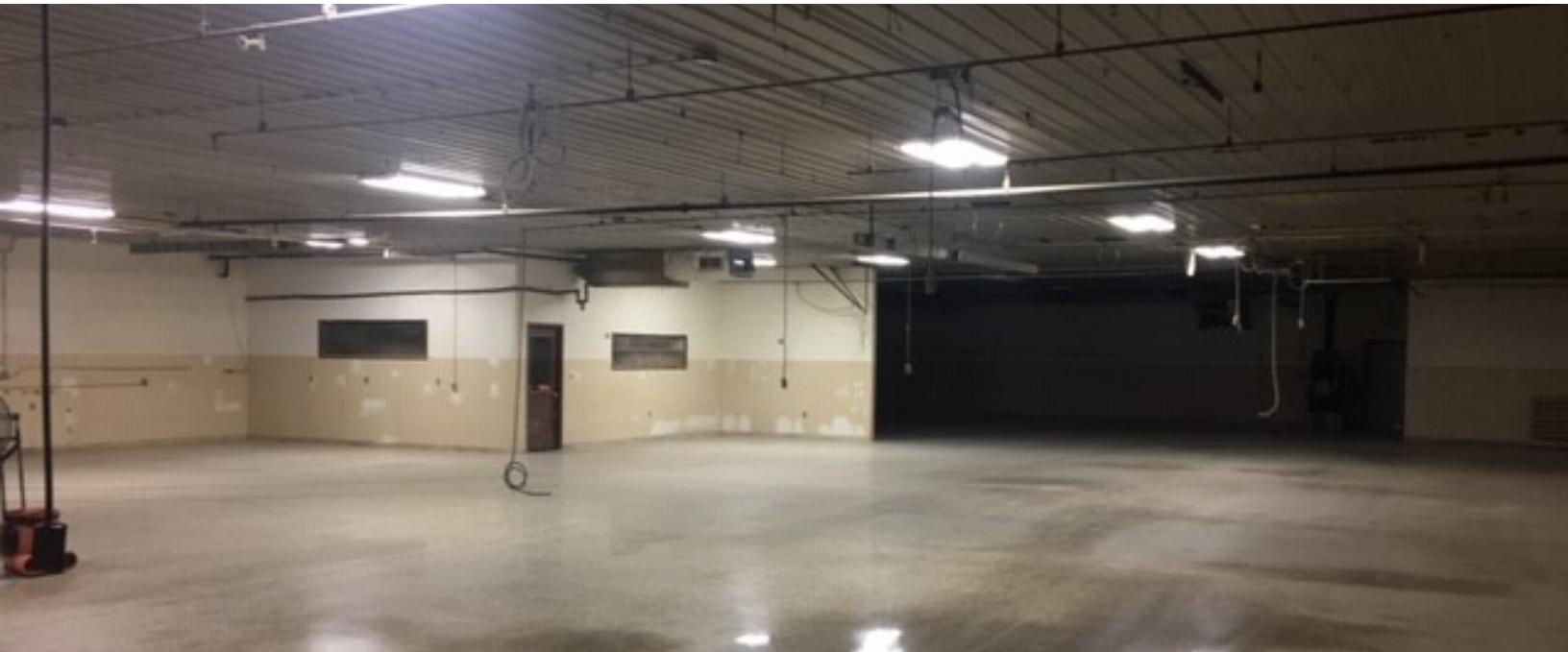
9,522 SF - Warehouse