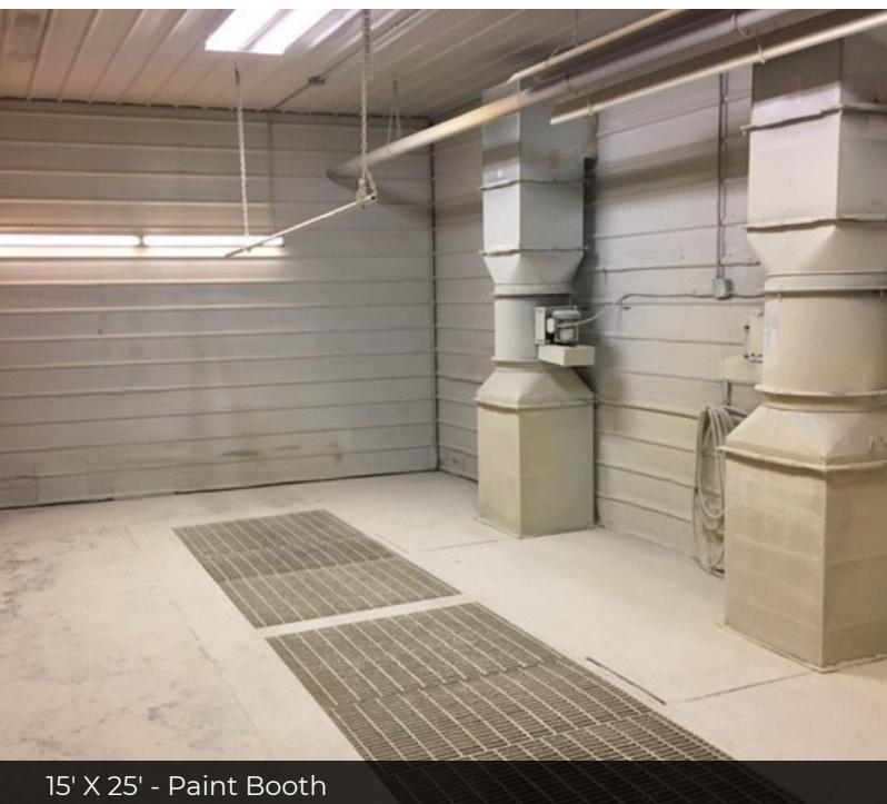
15' X 25' - Paint Booth