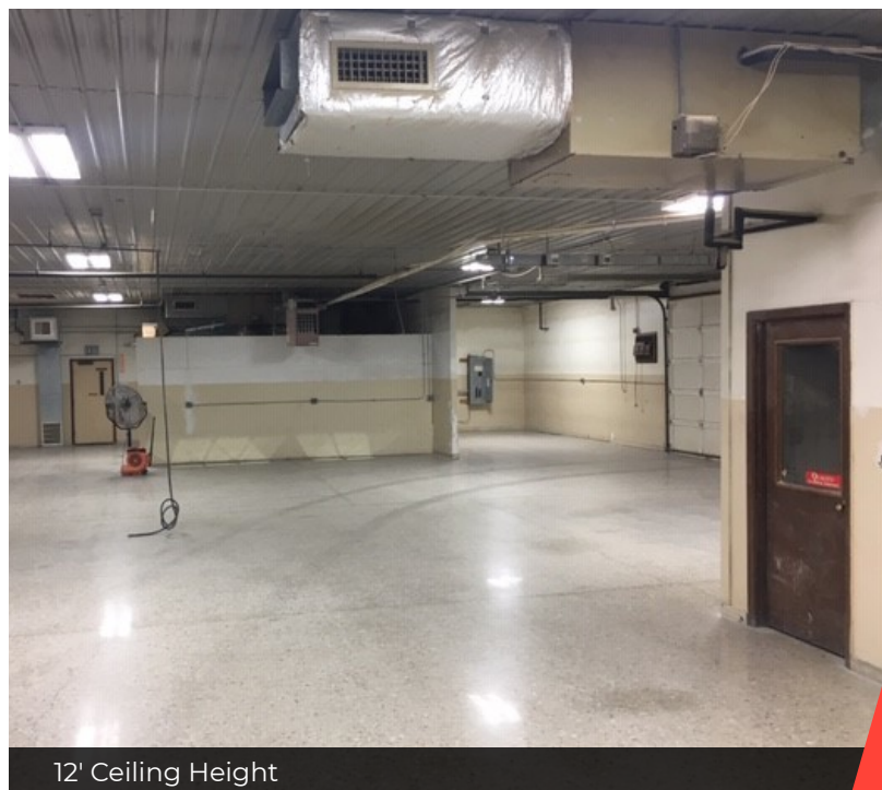
12' Ceiling Height