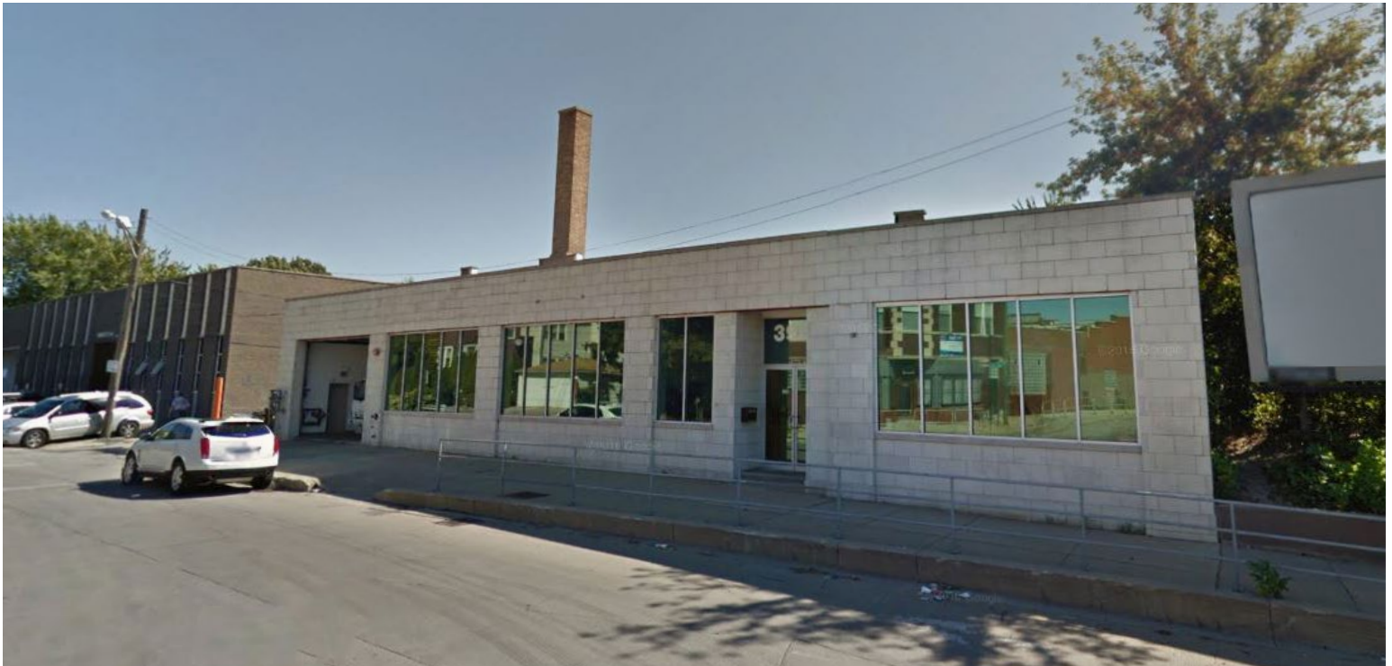
Streetview from N. Pulaski Rd.