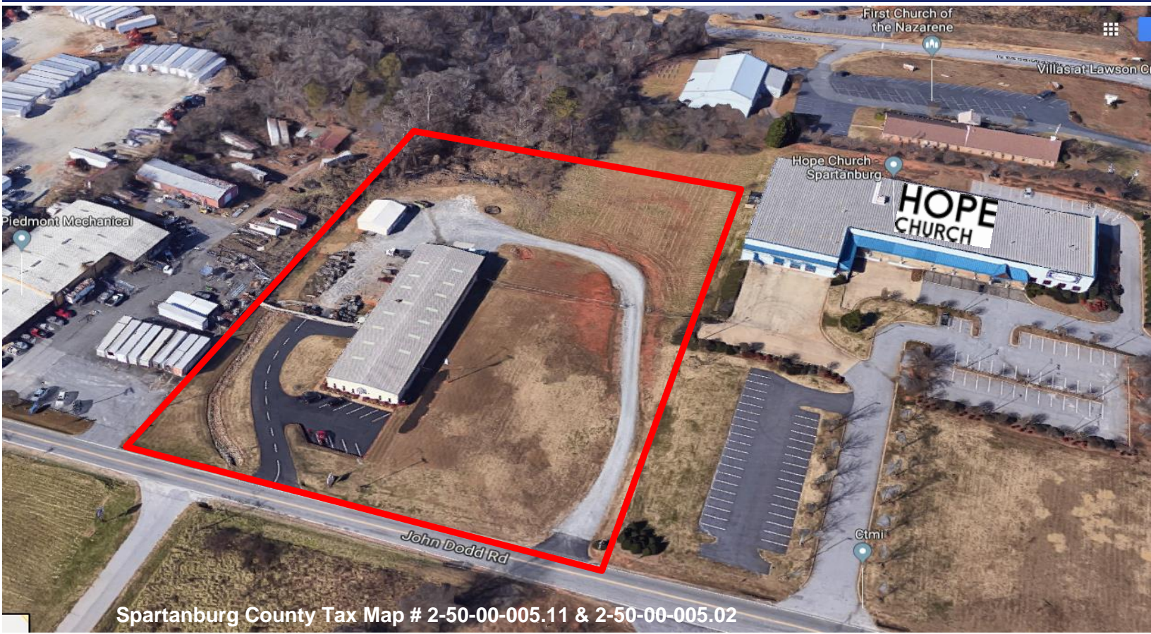
Spartanburg County Tax Map # 2-50-00-005.11 & 2-50-00-005.02