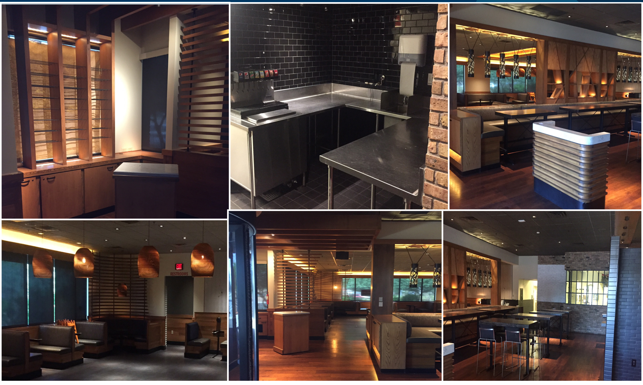
©2020 Cushman & Wakefield. All rights reserved. The information contained in this communication is strictly confidential. This information has been obtained from sources believed to be reliable but has not been verified. No warranty or representation, express or implied, is made as to the condition of the property (or properties) referenced herein or as to the accuracy or completeness of the information contained herein, and same is submitted subject to errors, omissions, change of price, rental or other conditions, withdrawal without notice, and to any special listing conditions imposed by the property owner(s). Any projections, opinions or estimates are subject to uncertainty and do not signify current or future property performance.