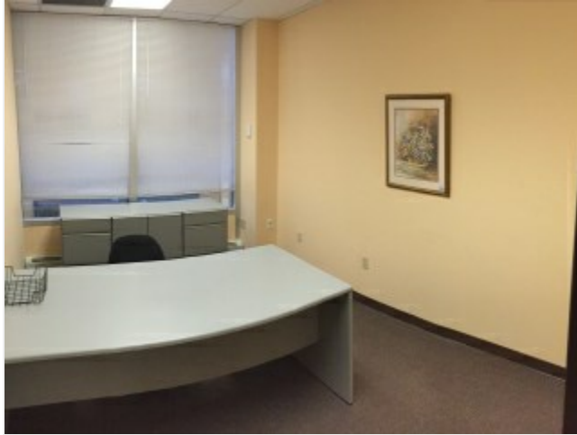
Fully Furnished Suites Available