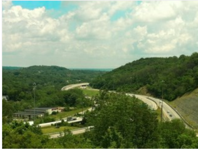
View from Property