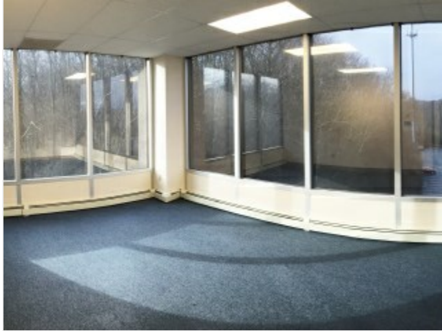
Small Suites with Views