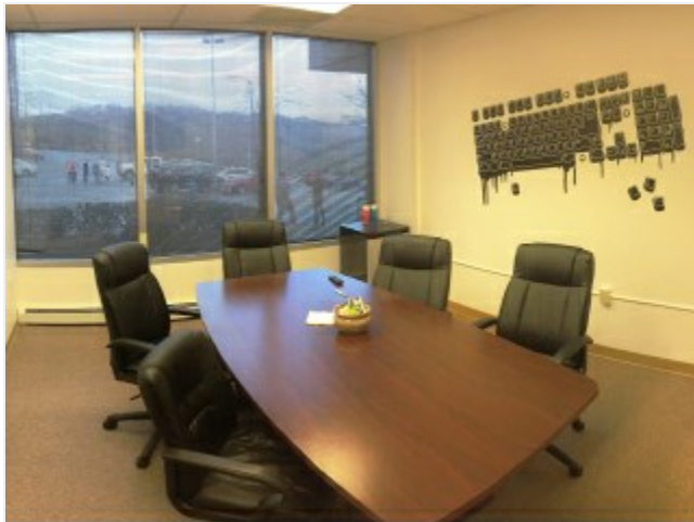
Private and Shared Conference Rooms