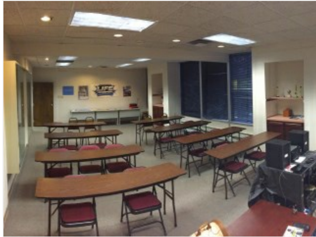
Training and Event Space