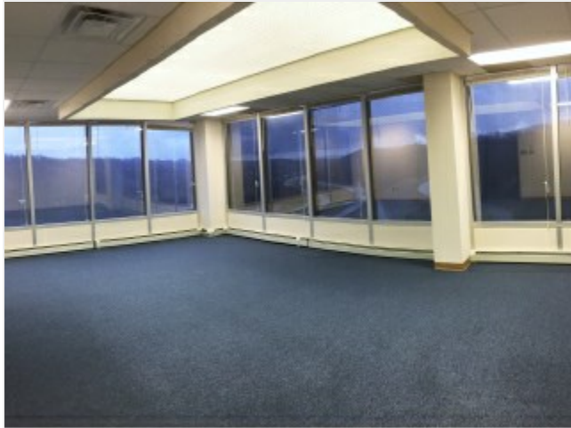
Large Suites with Views