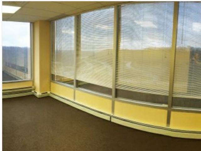
Small Suites with Views