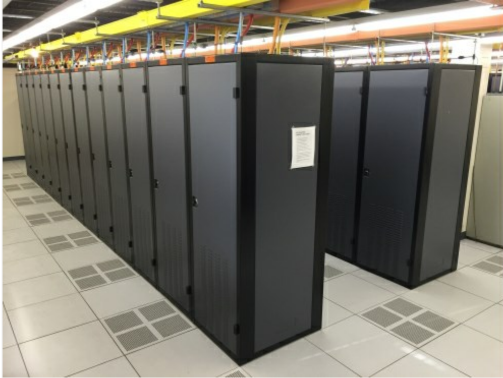
Data Center / Colocation Space