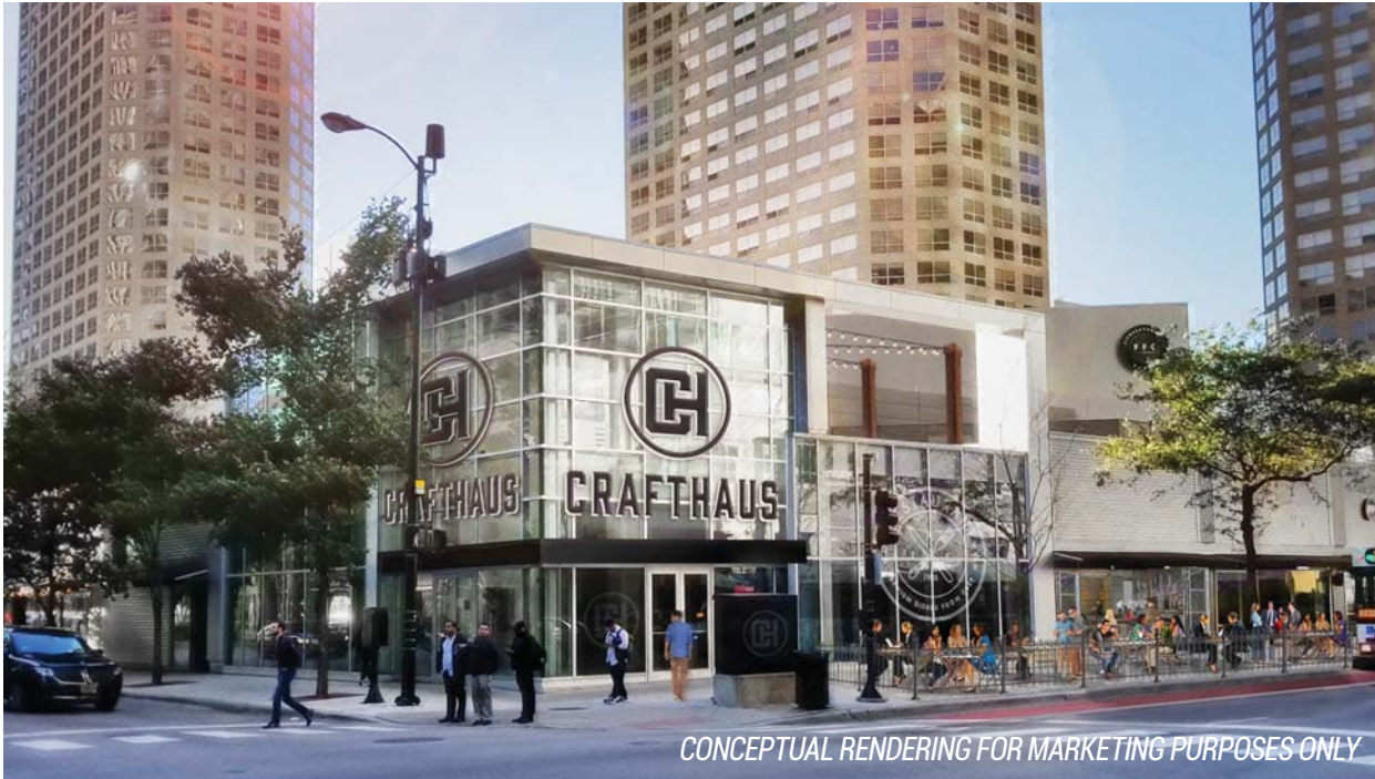
CONCEPTUAL RENDERING FOR MARKETING PURPOSES ONLY