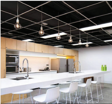
POLISHED CONCRETE AND OPEN CEILING AREA