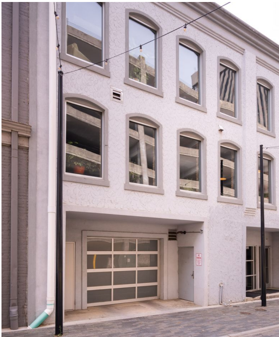
Parking Garage Entrance