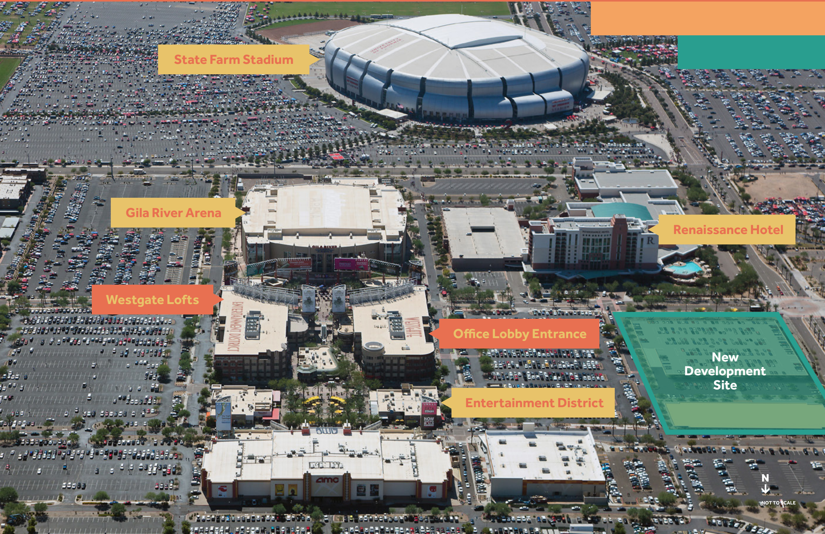
State Farm Stadium