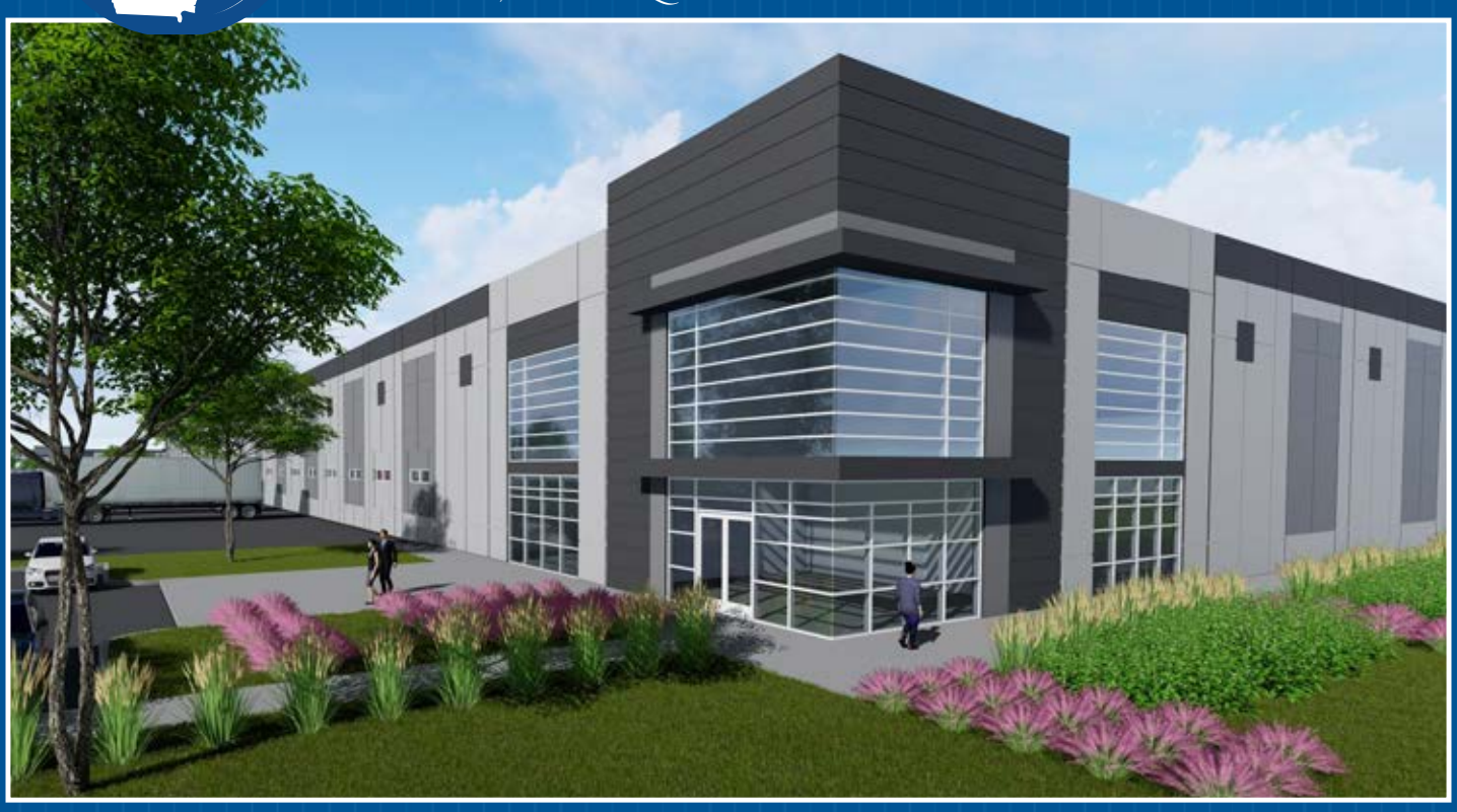
OAKLEY INDUSTRIAL BOULEVARD, UNION CITY, GA