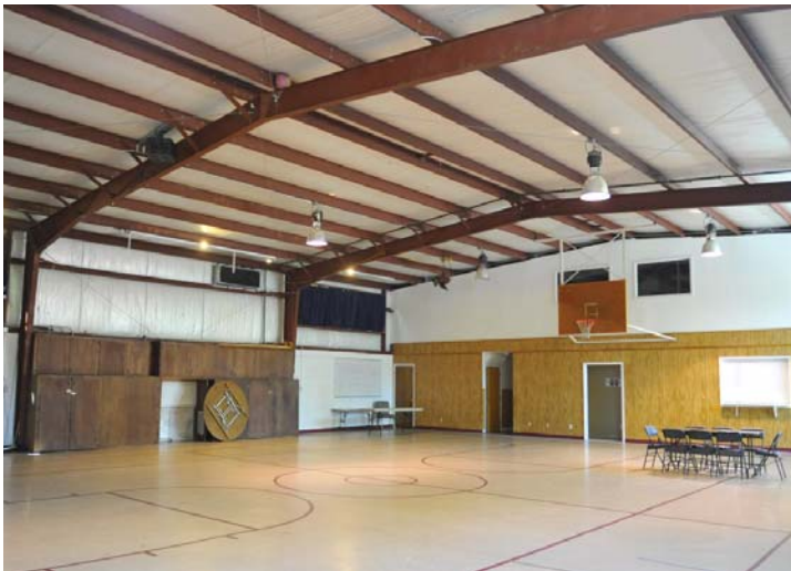
Gymnasium, loft , full commercial kitchen & Church Office 6,912 SF