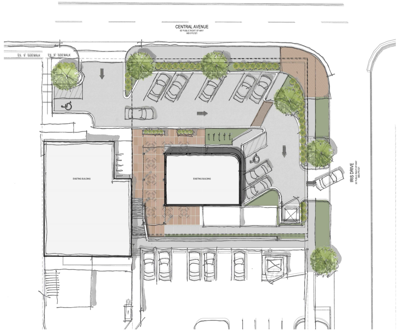
1 SITE PLAN SKETCH, N.T.S.