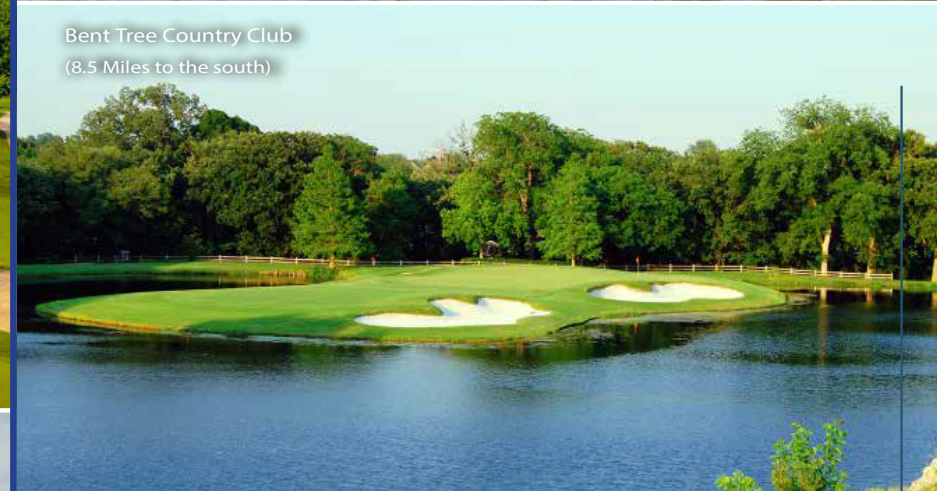
Bent Tree Country Club (8.5 Miles to the south)