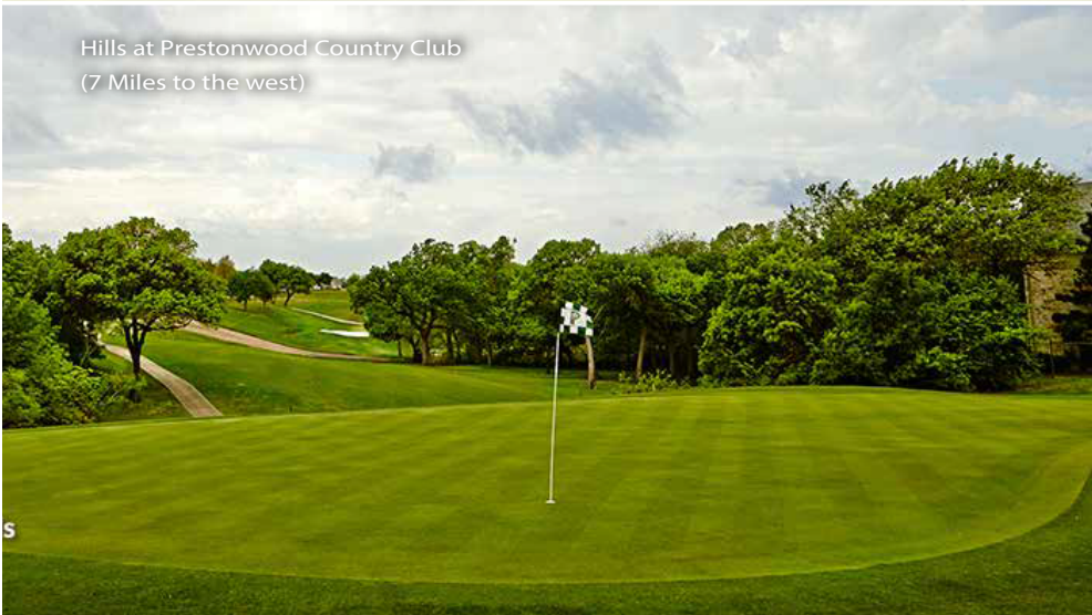
Hills at Prestonwood Country Club (7 Miles to the west)