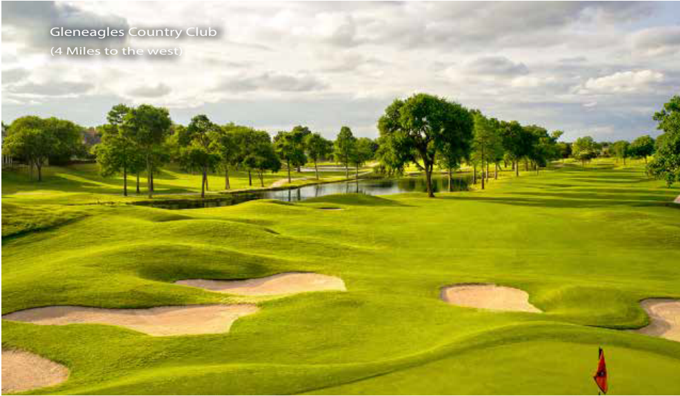
Gleneagles Country Club (4 Miles to the west)