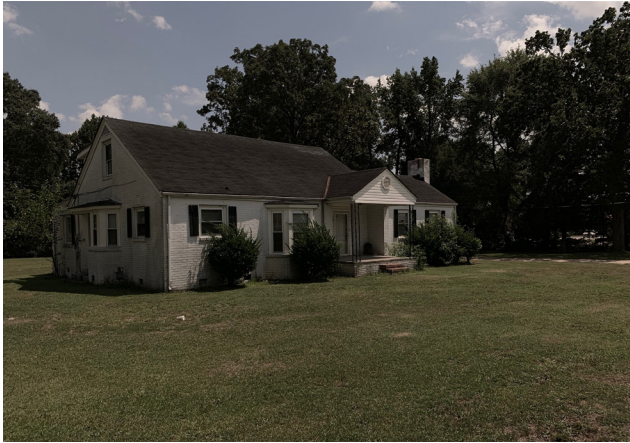
Exterior Front View