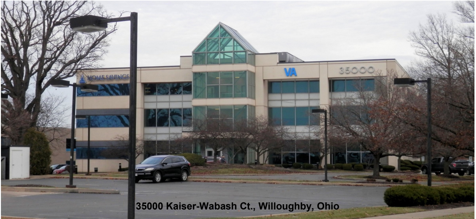
35000 Kaiser-Wabash Ct., Willoughby, Ohio