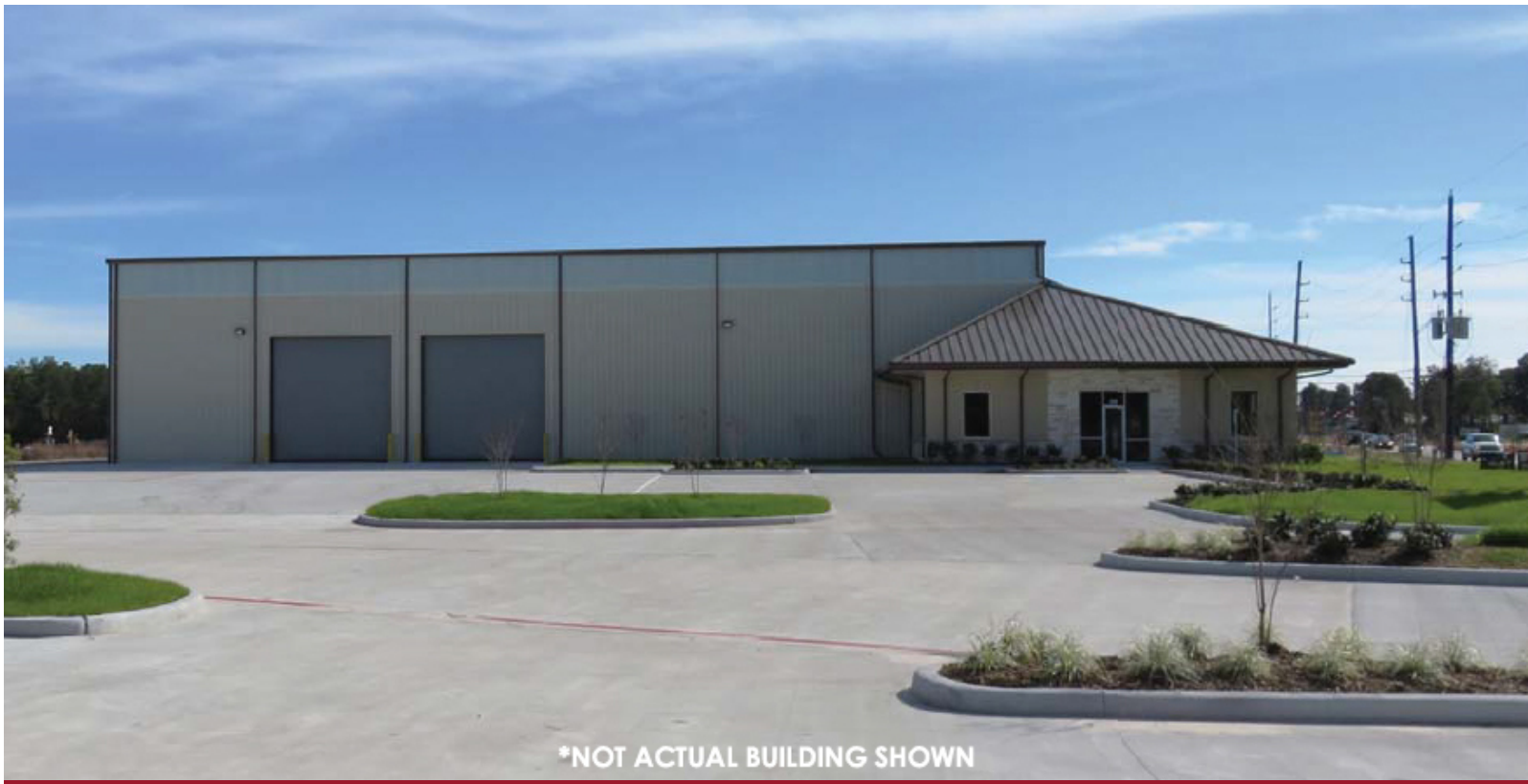
*NOT ACTUAL BUILDING SHOWN