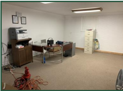
4377 Pio Nono Office 2