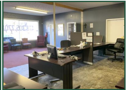
4385 Pio Nono Lobby