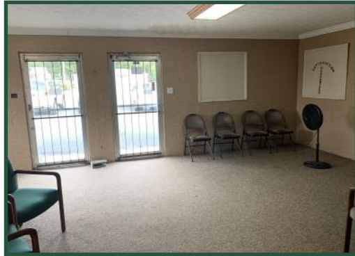
4377 Pio Nono Lobby