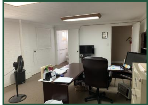
4377 Pio Nono Office 1