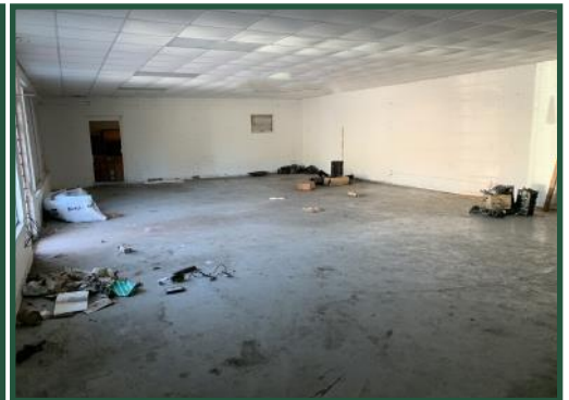
4395 Pio Nono Workshop