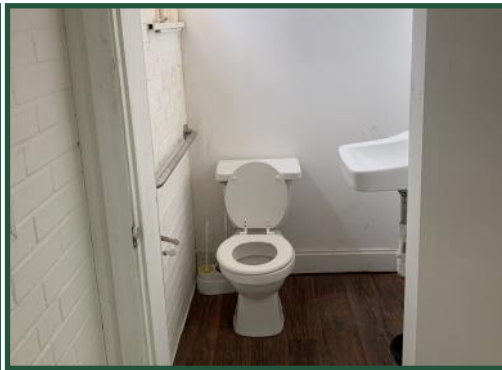
4377 Pio Nono Restroom